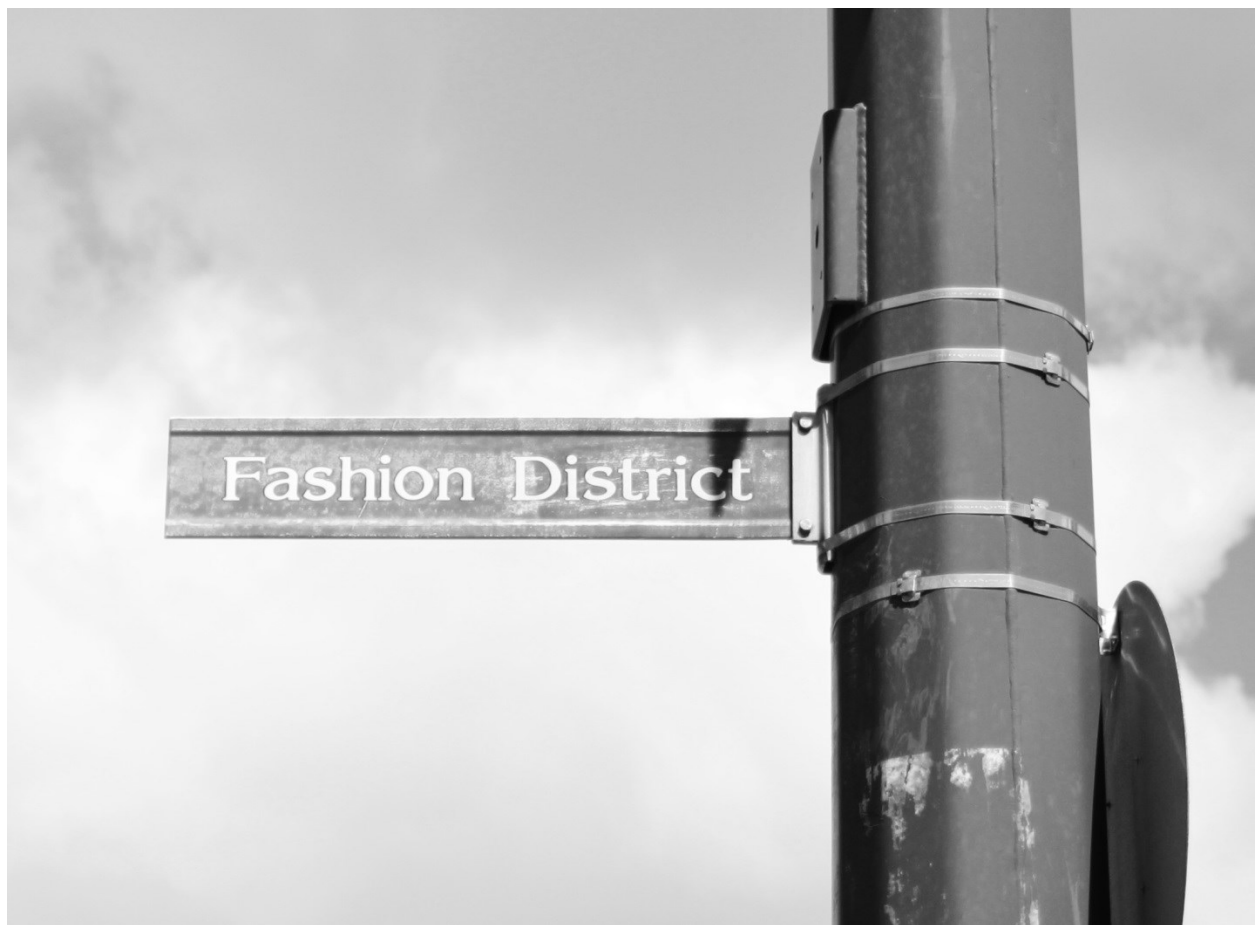
Toronto, 2014

Symposium goals: network with fashion scholars