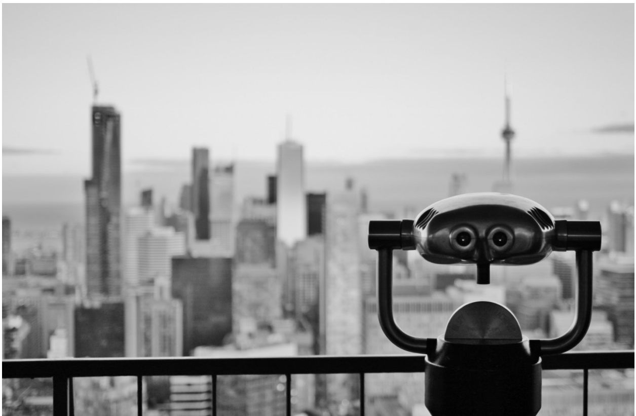
Toronto, 2014